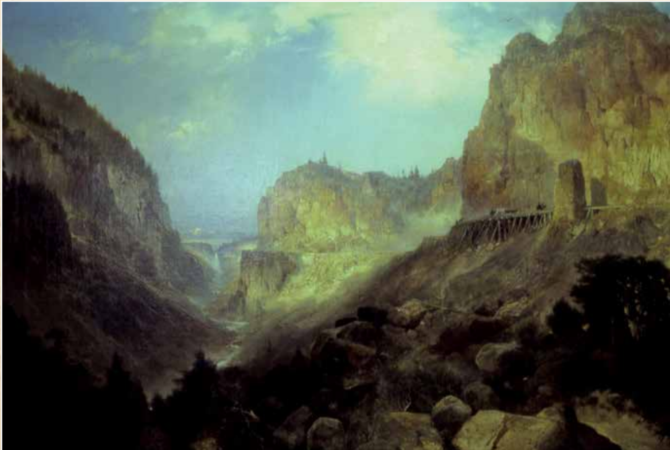
Thomas Moran [1837–1926], Golden Gate Courtesy: NPS, Yellowstone National Park

The parks were also visible on a commercial scale. In 1911, the Great Northern Railroad commissioned artist John Fery [1859–1934] to paint Glacier National Park